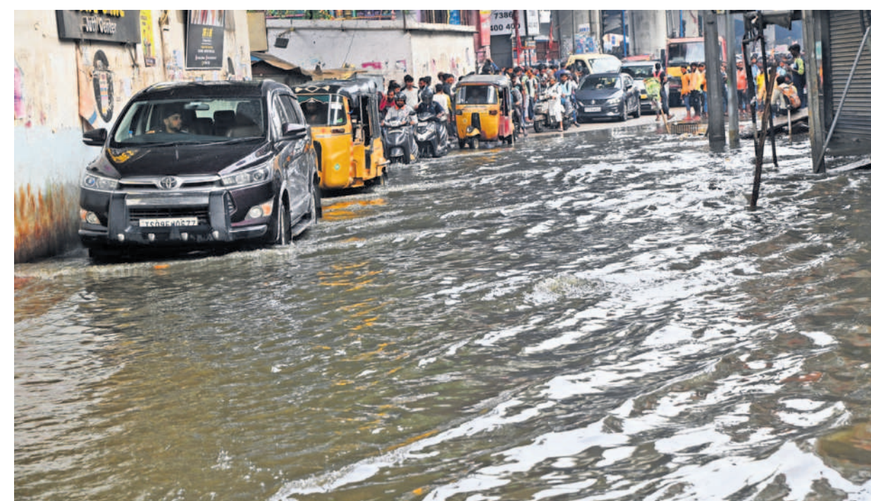
Vehicles make their way through a waterlogged road at Tolichowki in Hyderabad on Tuesday.

The residents of Nizampet, Kukatpally, Kondapur, Punjagutta and other neighbourhood areas say the thunderous sounds jolted them out of their sleep, while some likened it to an earthquake. In Punjagutta, an apartment bore the brunt of the storm, with the lightning strike reportedly demolishing the building's