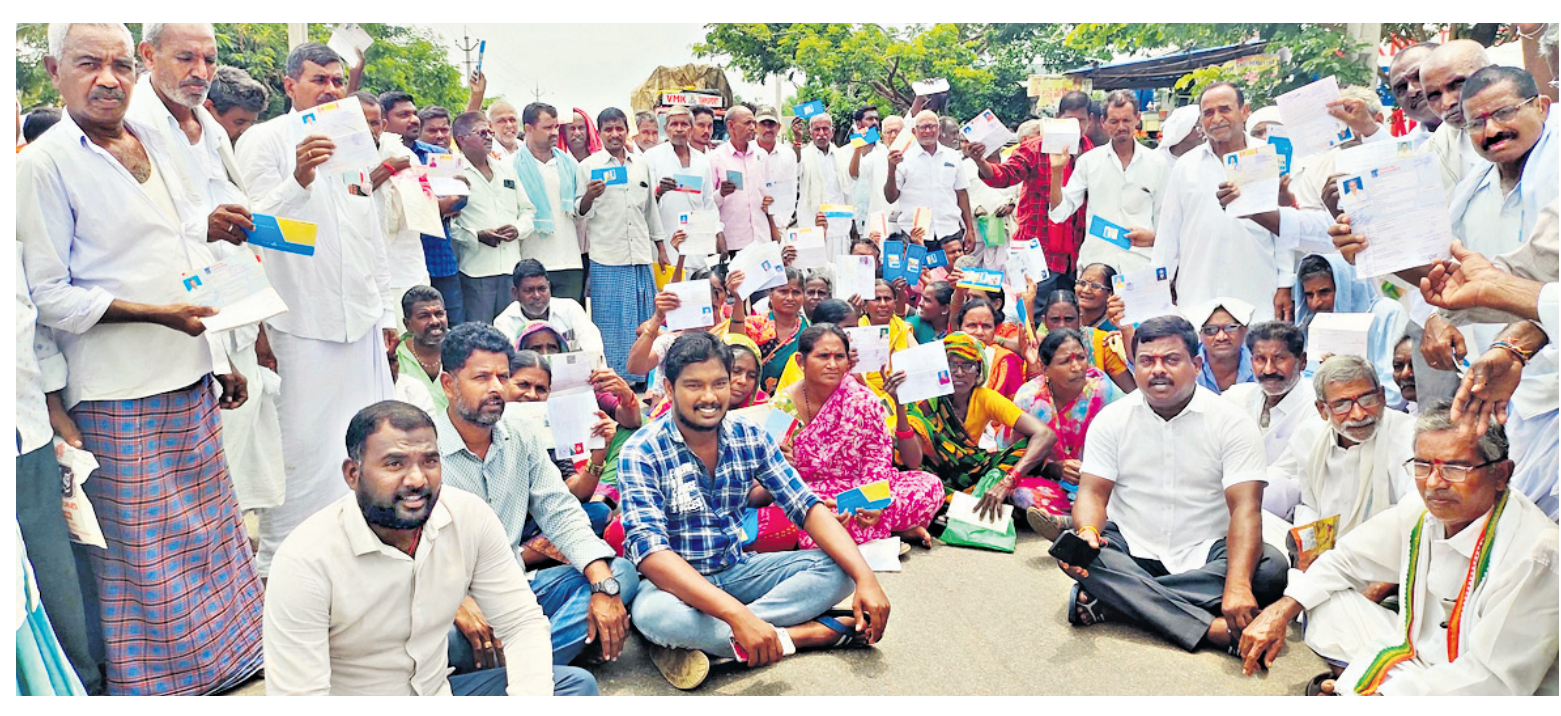
Farmers staging a dharna demanding loan waiver, in front of Canara Bank at Vempeta in Metpally mandal of Jagtial district on Saturday.

Burn effigies of CM, confront officials, take out processions across State