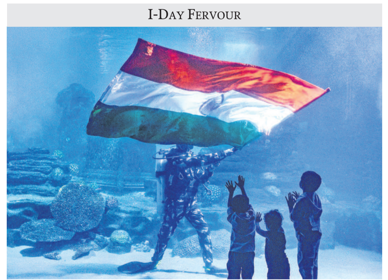
Kids watch the underwater flag-waving spectacle ahead of Independence Day, at VGP Marine Kingdom, Chennai on Tuesday.

petition moved by the victim's parents praying for a court-monitored probe and multiple other PILs seeking probe transfer to the CBI. (SEE PAGES 2, 7)