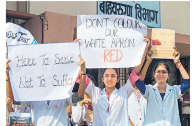
Doctors of Government Medical College in Nagpur protest the rape and killing of a PG trainee doctor in Kolkata.