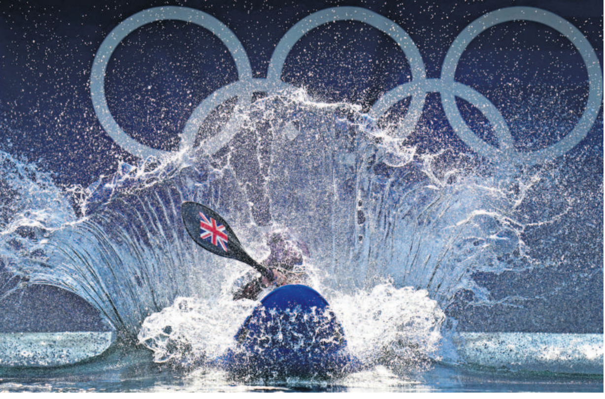
Kimberley Woods of Britain competes in the women's kayak cross time trial at the Paris Olympics 2024 in Vaires-sur-Marne, France. The over two-week sporting extravaganza concluded on Sunday. (REPORTS PAGE 10)