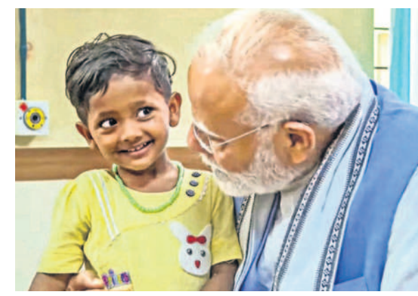
Prime Minister Narendra Modi interacts with a child affected by the recent landslide, at AWS Hospital in Wayanad.

Prime Minister Narendra Modi on Saturday said the Centre will provide all possible help in the relief and rehabilitation efforts in the landslides-hit areas of Wayanad district.