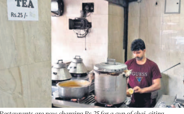
Restaurants are now charging Rs 25 for a cup of chai, citing increasing prices of tea powder and cooking gas.

"Traders have increased the prices of tea powder by Rs 150 to Rs 180 per kg. This has forced us to increase tea prices," said Mohd Amair, manager at Al Saba Hotel at Mallepally. On average, a hotel located at a prime location sells anywhere between 6,000 and 8,000 cups of tea. A few restaurants in