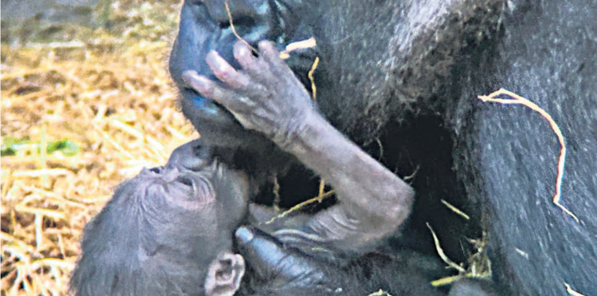
A baby gorilla, the first to be born at the Detroit Zoo in US. According to zoo authorities, the birth was the first in its 96-year history. The baby gorilla doesn't have a name yet, and the sex has not been determined.

The small cluster concept can be beneficial, but it all depends on the State government's commitment to effectively implement the proposed ideas, said an office-bearer of the Federation of Pharma Entrepreneurs Telangana and Andhra Pradesh. For the successful implementation of ideas, one industry giant should lead the initiatives proposed by the government in each cluster. (SEE PAGE 2)