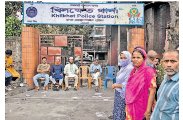
People keep guard in front of a police station which was vandalised, in Dhaka.

In India's first reaction to the dramatic developments in Bangladesh, Jaishankar, in suo-motu statements in both houses of Parliament, said Hasina decided to resign after a meeting with leaders of the security establishment and requested for approval "at very short notice" to come to India "for the moment". "We are also monitoring the situation with regard to the status of minorities. There are reports of initiatives by various organisations to ensure their protection and well-being," he said. "We welcome that, but will naturally remain deeply concerned till law and order is visibly restored. Our border guarding forces have also been instructed to be exceptionally alert," he added. (SEE PAGES 2, 7, 9)