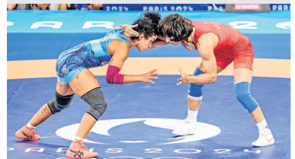
India's Vinesh Phogat in action against Cuba's Yusneylys Guzman Lopez in the Women's Freestyle 50kg semifinal in Paris. Vinesh beat Lopez to become the first Indian woman grappler to enter the final at the Olympics. (REPORT PAGE 10)