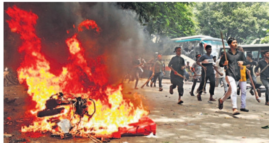
Protesters run past a burning vehicle at the Bangabandhu Sheikh Mujib Medical University Hospital during a rally against Prime Minister Sheikh Hasina in Dhaka on Sunday.

At least 91 people have been killed in clashes, shootings and counter-chases across the country surrounding the non-cooperation programme, leading Bengali-language daily Prothom Alo reported. According to the police headquarters, 14 policemen have been killed across the country. Of them, 13 were killed in Sirajganj's Enayetpur police station.