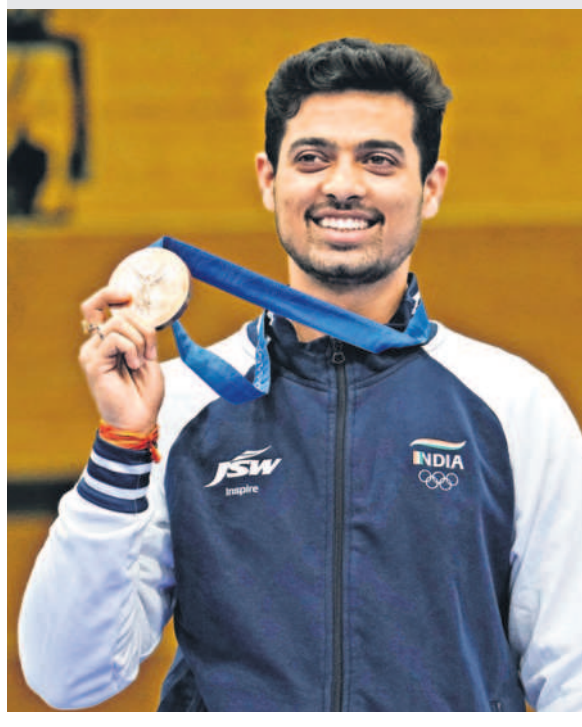
Swapnil Kusale celebrates after winning bronze in the 50m rifle 3 positions men's final at the 2024 Paris Olympics. This is India's first-ever Olympic medal in the event. (REPORT PAGE 10)