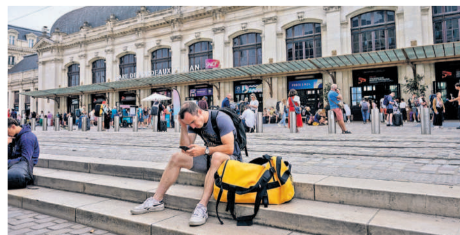
Travellers wait outside the Gare de Bordeaux Saint-Jean in France on Friday. The rail network was hit with "criminal" acts of vandalism hours before the grand opening ceremony of the Games.