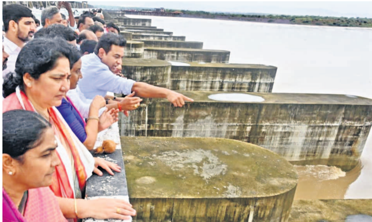
BRS working president KT Rama Rao along with party MLAs and MLCs at the Lakshmi pumphouse on Friday.

KTR urges govt to shun politics, operate Kannepally pumphouse