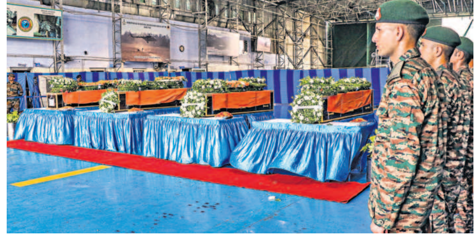
Army personnel pay tribute to the mortal remains of the soldiers in Doda on Tuesday.

This was the third major encounter between security forces and terrorists in the forests of Doda district in the past three weeks. The latest incident comes a week after a terrorist ambush on an Army patrol in the remote Machedi forest belt in Kathua district claimed the lives of five soldiers and injured as many. Troops of the