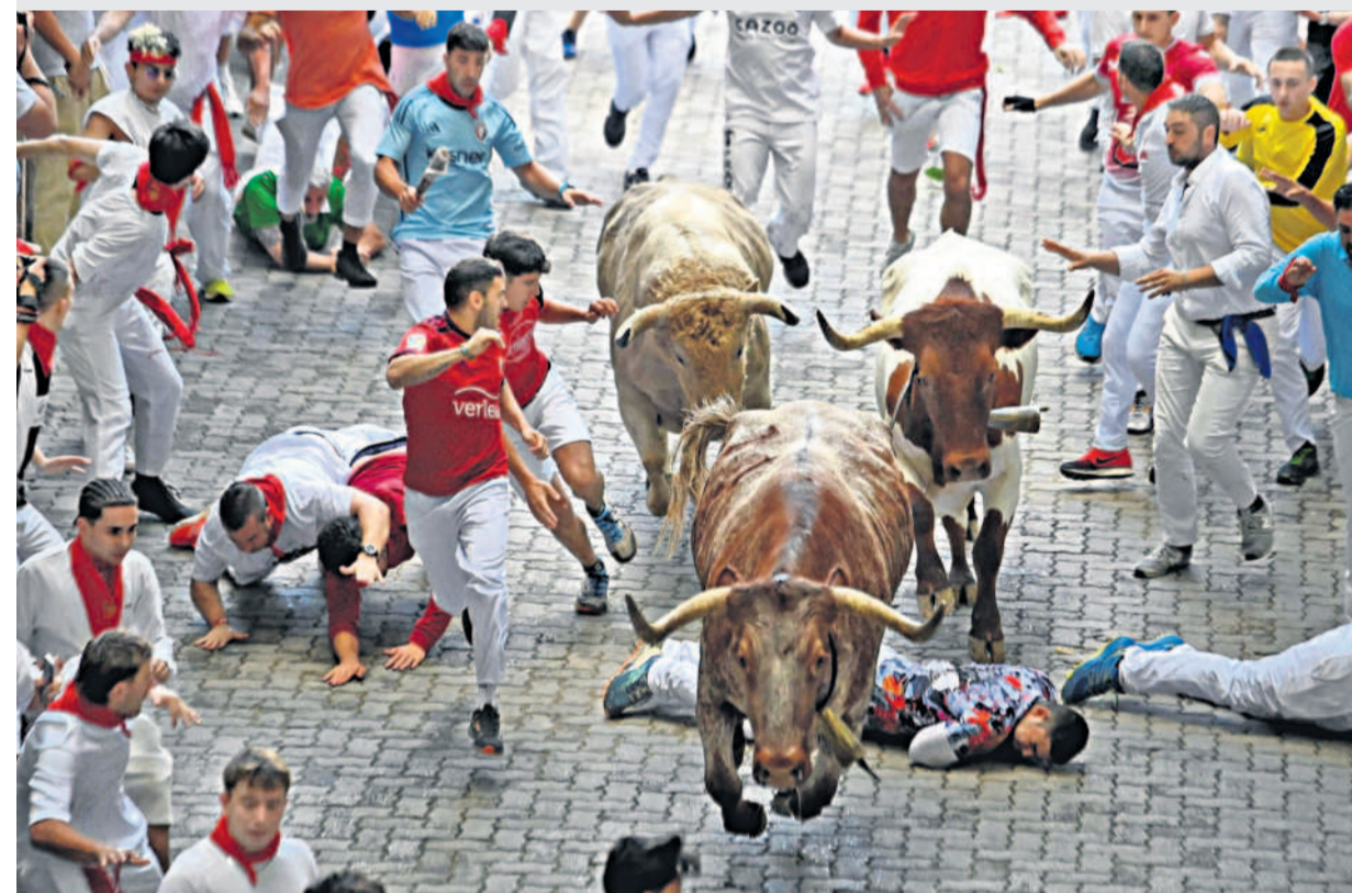
Participants run ahead of bulls during the San Fermin festival in Pamplona, northern Spain, on Friday.