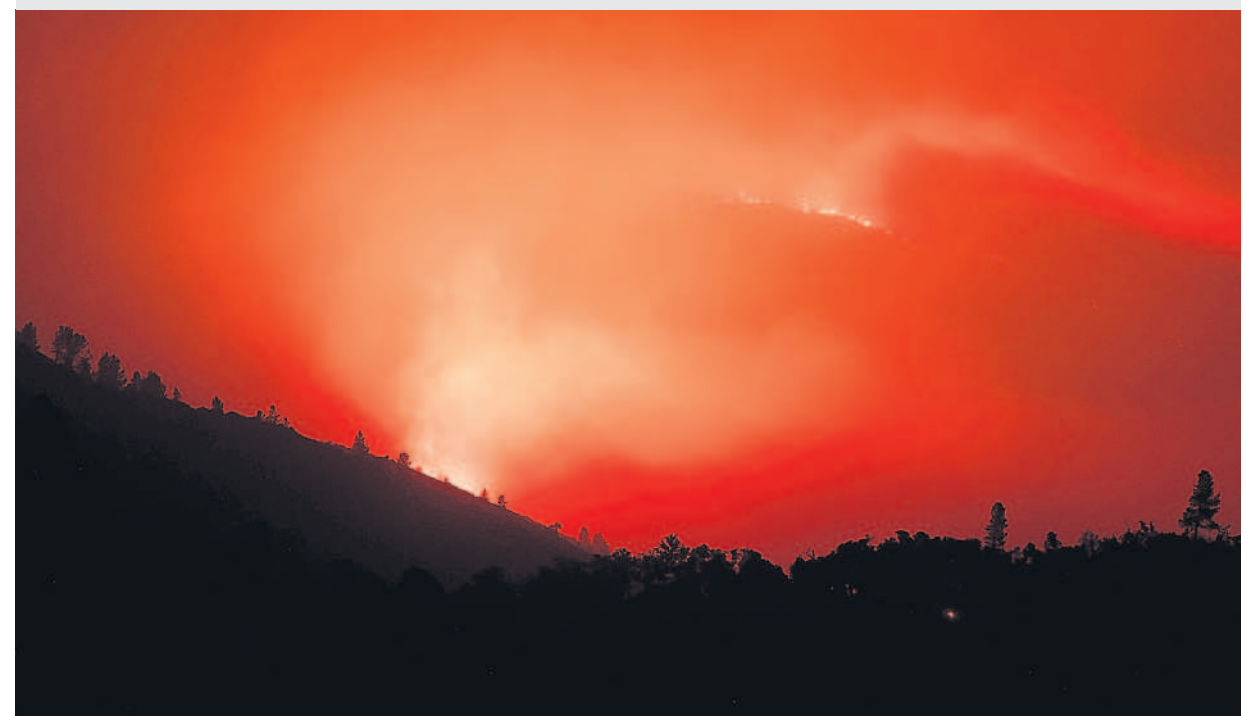
A wildfire rages on at Lake Fire in Los Olivos, California. Over 1,000 firefighters have been battling the blaze, which could be contained only to 16 per cent, say officials.