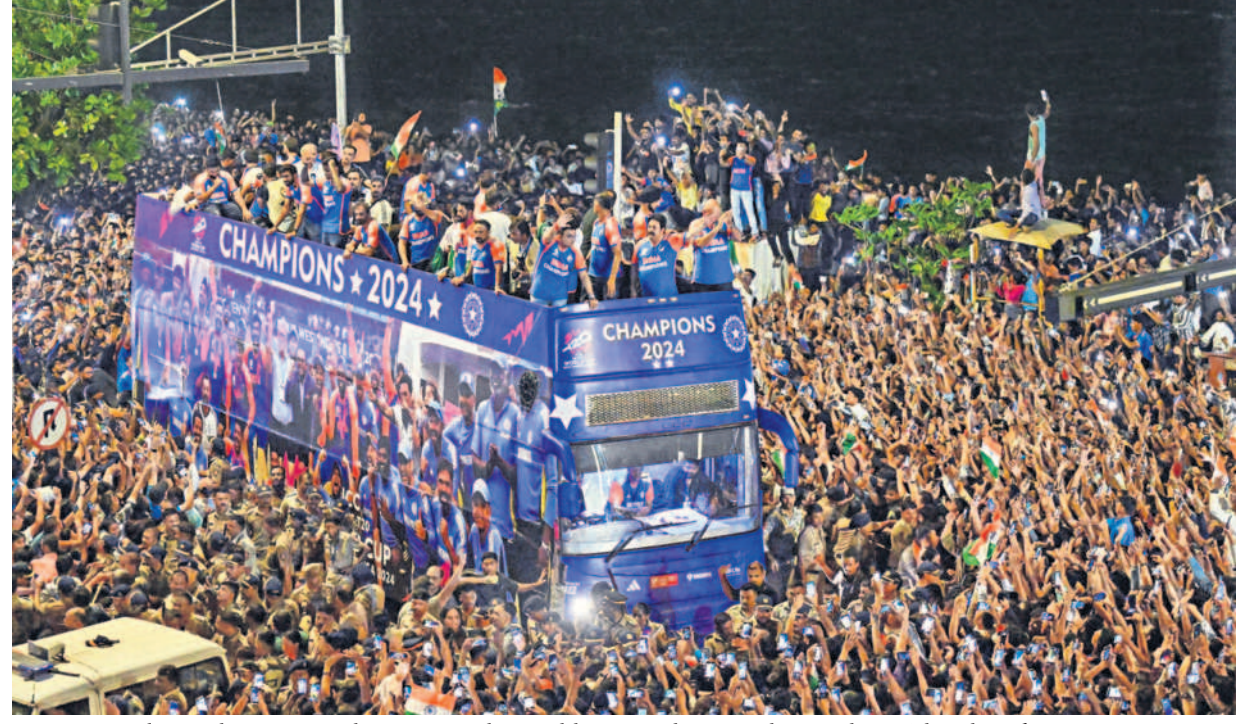
Indian cricketers gesture during an open bus roadshow upon their arrival in Mumbai on Thursday, after winning the ICC men's T20 World Cup in Barbados. (REPORT PAGE 10)