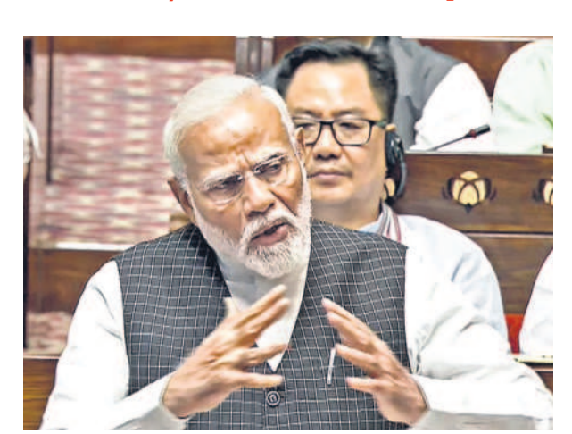
Prime Minister Narendra Modi replies to the Motion of Thanks on the President's address in Rajya Sabha on Wednesday.

The Prime Minister took the Congress to the cleaners over making the 2024 general elections about the pro-