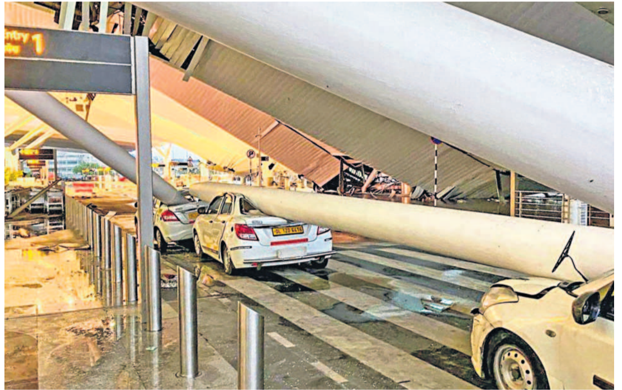
Vehicles crushed after a portion of the roof at the Delhi Airport's Terminal-1 collapsed amid heavy rainfall, on Friday.

At the airport's busy Terminal 1, the rain destruction took a tragic turn. Around 5 am, the massive canopy covering the departure area gave way, trapping several people. Besides the roof sheet, support beams collapsed, pinning down parked cars. A taxi driver, identified as Ramesh Kumar, was rescued from a car on which an iron beam had fallen but was declared dead when he was taken to the Medanta Hospital facility near the terminal. The injured were admitted to