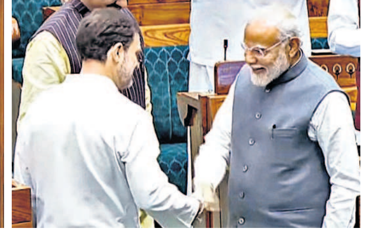
Lok Sabha Speaker Om Birla conducts the proceedings of the House during the first session of the 18th Lok Sabha. Prime Minister Narendra Modi and LOP Rahul Gandhi greet each other as they accompany Birla to the chair. (REPORTS PAGE 7)