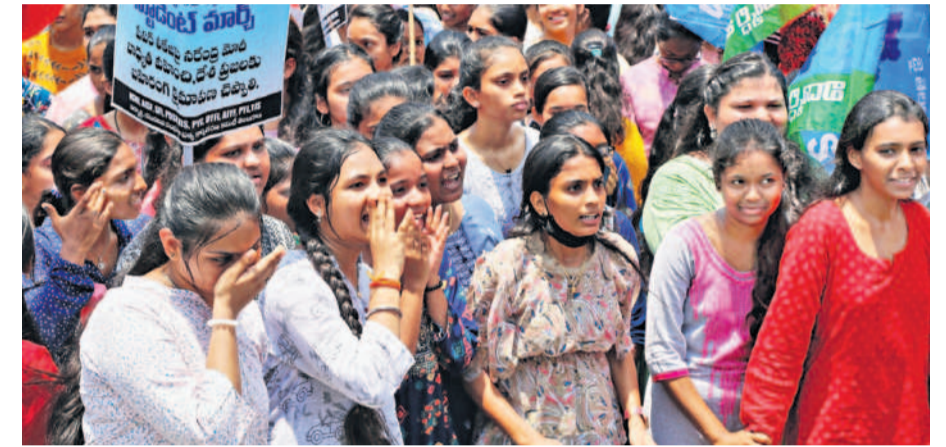
Aspirants taking part in a protest organised by student unions against NEET, in Hyderabad.

Says even 0.001% negligence must be dealt with