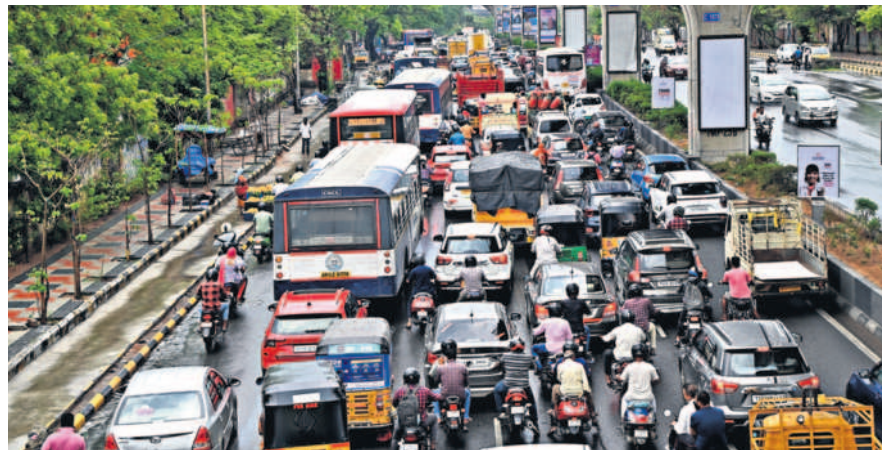
Equipped with advanced surveillance capabilities, the Third Eye Traffic Monitoring Drone will enable real-time updates of traffic flow and related issues.