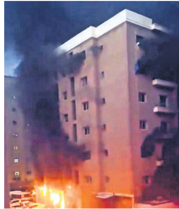
The building had 195 workers living in it, mostly Indians employed at a supermarket chain owned by an NRI businessman.

The fire broke out in a kitchen on the ground floor of the six-storey building on Wednesday morning in Mangaf area's Block-4 of the city. It accommodated 195 workers, mostly Indians employed at a supermarket chain owned by an NRI