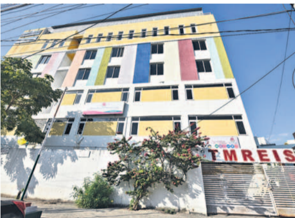
Despite the remarks, parents have been flocking to the Welfare Residential Educational Institutions Societies' office for admission.

Chief Minister A Revanth Reddy's view that residential schools have impacted the familial bonds appear misplaced and contrarian to the positive approach of scores of parents who have been reaping benefits by admitting their children in these schools in Telangana. While the Chief Minister stated that bonding between parents and their wards was weakening as students were admitted into the residential schools at a very young age, several parents have been flocking to the Welfare Residential Educational Institutions Societies' office at Masab Tank seeking admissions for their wards.