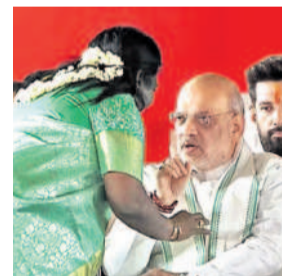
Video shows Amit Shah gesturing sternly at Tamilisai Soundararajan.

The video shows Soundararajan walking up to the stage and greeting former Vice President Venkaiah Naidu and Shah, who were sitting next to each other. As she walks past them, Shah calls her back. What follows next is what caught the imagination of netizens, with Shah