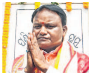
Odisha Chief Minister Mohan Majhi