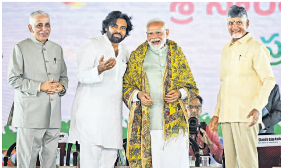
Andhra Pradesh Governor SA Nazeer, JSP chief Pawan Kalyan, Prime Minister Narendra Modi and AP Chief Minister N Chandrababu Naidu at the swearing-in ceremony on Wednesday.

Modi hugged and patted Naidu after the TDP supremo took the oath of office. The ceremony was also attended by Union Ministers Amit Shah, Nitin Gadkari and JP Nadda. Maharashtra Chief Minister