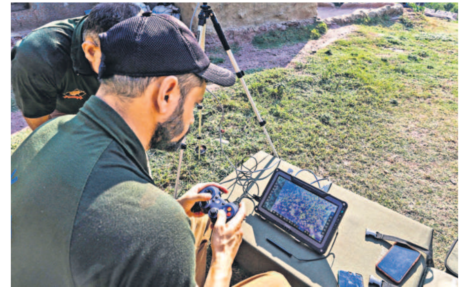
Security personnel conduct search operation using drone after a bus carrying pilgrims was ambushed by terrorists, in Reasi district of Jammu and Kashmir, on Monday.