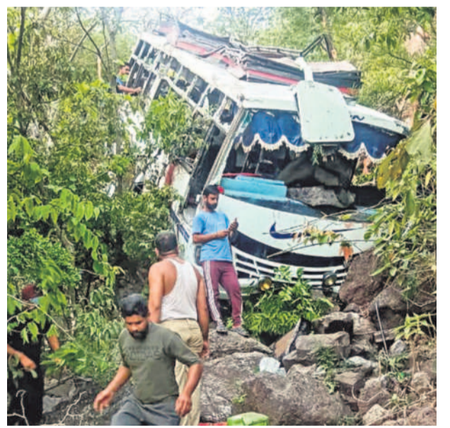
The damaged bus after it plunged into a gorge following the terrorist attack, in Reasi district of J&K, on Sunday.

Attack marks escalation in violence in the region as Reasi had been relatively untouched by terrorist activities