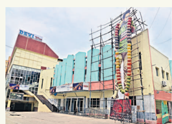
The lack of significant movie releases in the recent months has forced the theatres in the State to shut down for 10 days.

The temporary closure is slated to start on Friday and theatres are expected to resume normal opera-