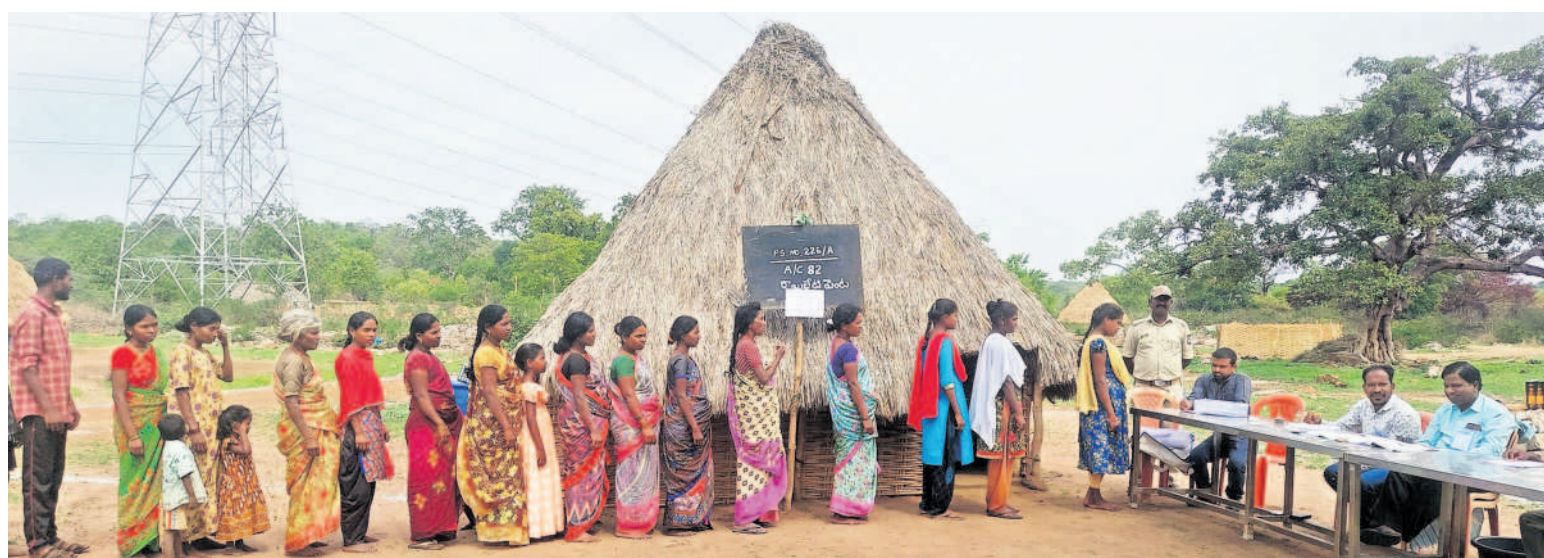
Chenchu women stand in queue to exercise their franchise in the Lok Sabha elections, in Nagarkurnool district on Monday.

Polling ends peacefully; Bhongir records highest poll percentage of 76.47%