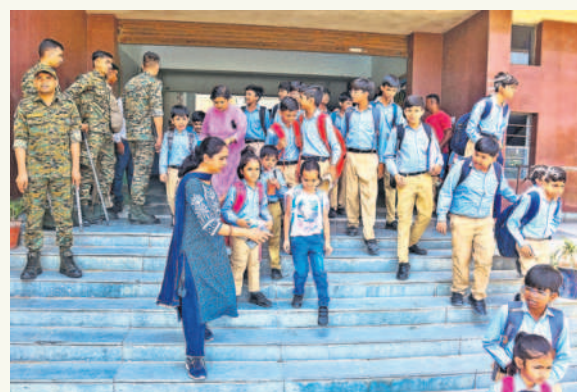
Students being evacuated from Jaipuria school after it received a bomb threat via email, in Jaipur on Monday.

Over 50 schools here received bomb threats via email on Monday morning, triggering panic among students and their parents, police said. However, no explosive or anything suspicious has been found so far in these schools, they added. The threatening emails to schools came 12 days after a similar scare in Delhi-NCR where 150 schools received bomb threat emails from a Russia-based mailing service on May 1, triggering massive evacuations and searches. The emails to schools in Jaipur also happen to come on the 16th anniversary of the serial bomb