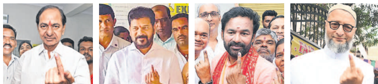
(From left) BRS chief K Chandrashekhara Rao, Chief Minister A Revanth Reddy, Union Minister G Kishan Reddy and AIMIM chief Asaduddin Owaisi show their inked fingers after voting on Monday.

People woke up to cool weather in peak summer in most parts of the State on Monday and tuned up in large numbers to cast their votes in the initial hours. However, urban areas, especially Hyderabad, Secunderabad and Malkajgiri parlia-