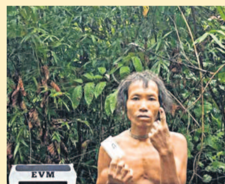
A voter from the Shompen tribal community after casting his vote in Andaman and Nicobar Islands.

THE FIRST AND BIGGEST PHASE OF THE SEVEN-PHASED ELECTIONS BEGAN AT 7 AM IN ALL CONSTITUENCIES. AMONG THE VOTERS WERE FIRST-TIMERS, MANY NEWLY-WED COUPLES WHO CAME IN THEIR TRADITIONAL ATTIRE, PHYSICALLY-CHALLENGED PEOPLE AND SOME ELDERLY PERSONS