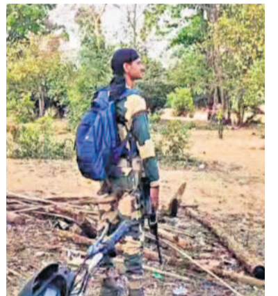
Security personnel at the encounter site in Kanker district on Tuesday.