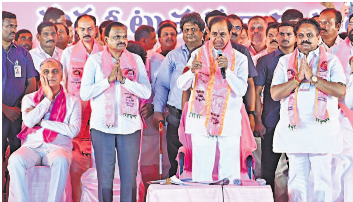
Leader of Opposition and BRS president K Chandrashekar Rao during the Praja Ashirvada Sabha at Sulthanpur in Medak on Tuesday.

"While we wish the Congress government to complete its five-year term, recent developments and the Chief Minister's remarks cast doubts on its survival. While there is uncertainty over the number of people defecting from the Congress to the BJP, we need not wonder if the Chief Minister himself shifts loyalties considering his subtle gestures towards the BJP in recent times," Chandrashekar Rao said.