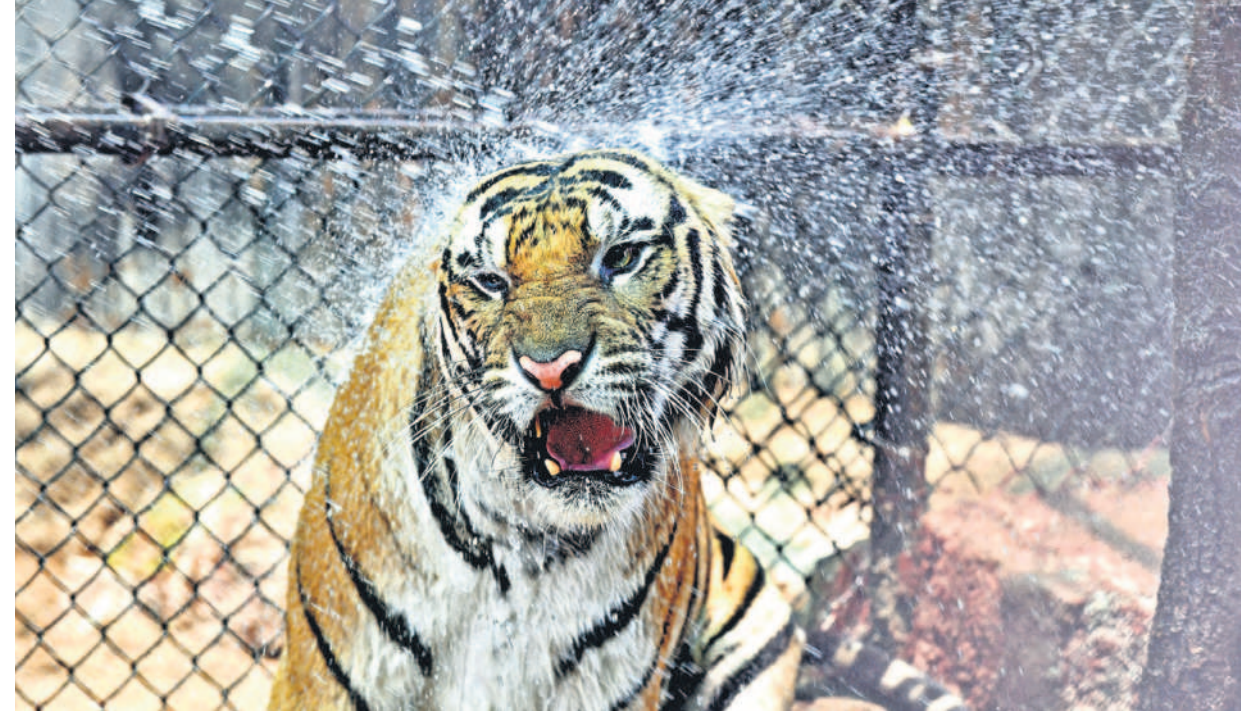
A tiger cools off as water sprinklers get activated in the enclosure amid a heatwave, at the Nehru zoo.

degrees Celsius. Within the Greater Hyderabad Municipal Corporation (GHMC) limits, Moosapet sizzled at 41.9 degrees Celsius. Numerous localities within the city have been hit particularly