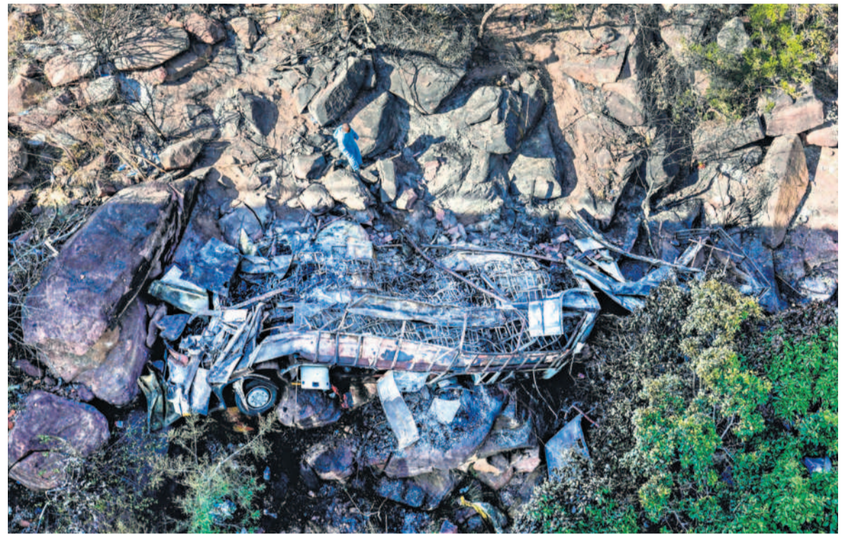
TRAGIC OUTING: The wreckage of the bus which plunged off a bridge on the Mmamatlakala mountain pass in South Africa on Friday. An 8-year-old child was the only survivor of the crash that killed 45. (REPORT PAGE 9)