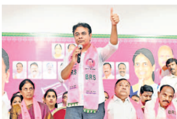
BRS working president KT Rama Rao addressing party workers at Telangana Bhavan in Hyderabad on Friday.

He urged the cadre to work collectively in advancing the party's agenda and ensuring the party's victory in their respective constituencies. Participating in the Chevella parliamentary party preparatory meeting at Telangana Bhavan on Friday, Rama Rao said he would not want to comment on the exit of senior leaders like K Keshava Rao,