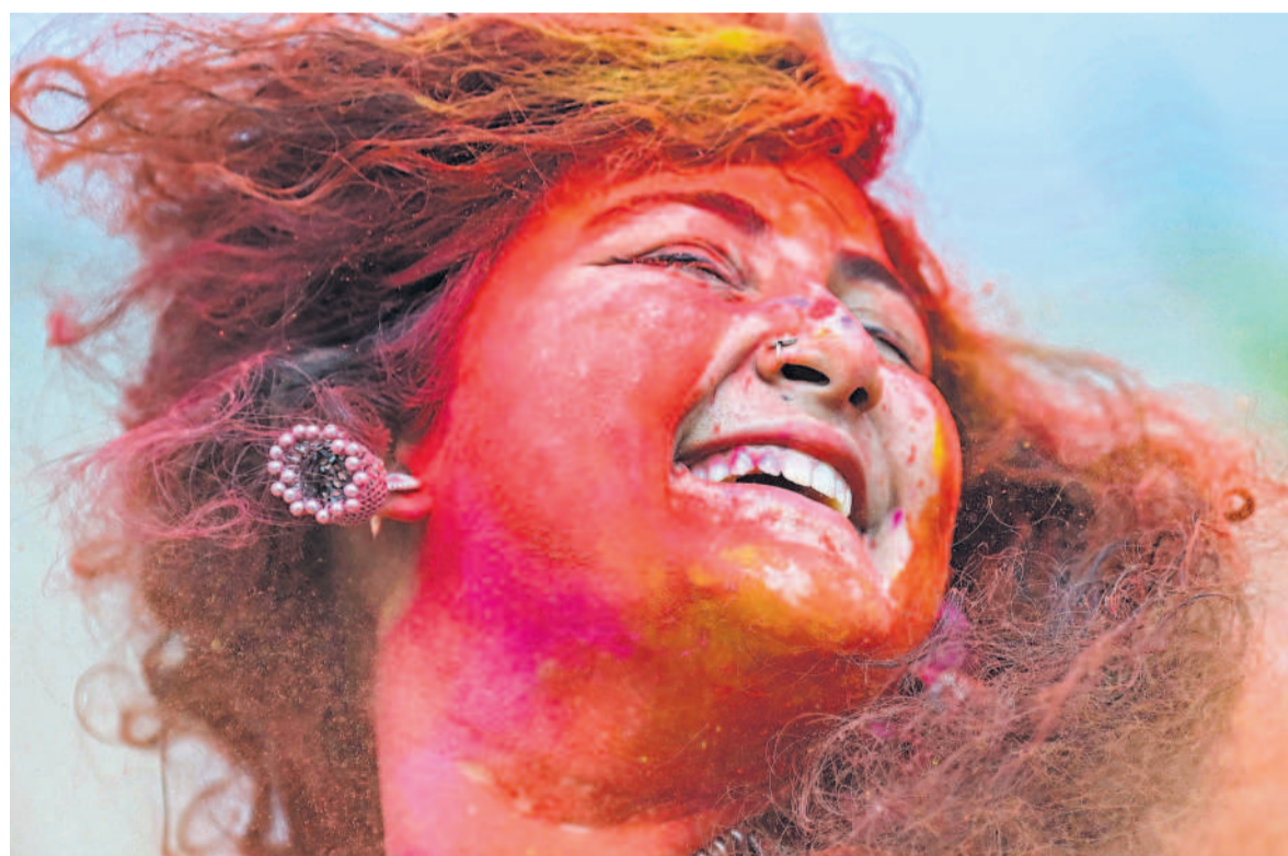
MUCH-AWAITED FEST: A woman smeared with gulas during Holi celebrations in Agartala on Sunday.