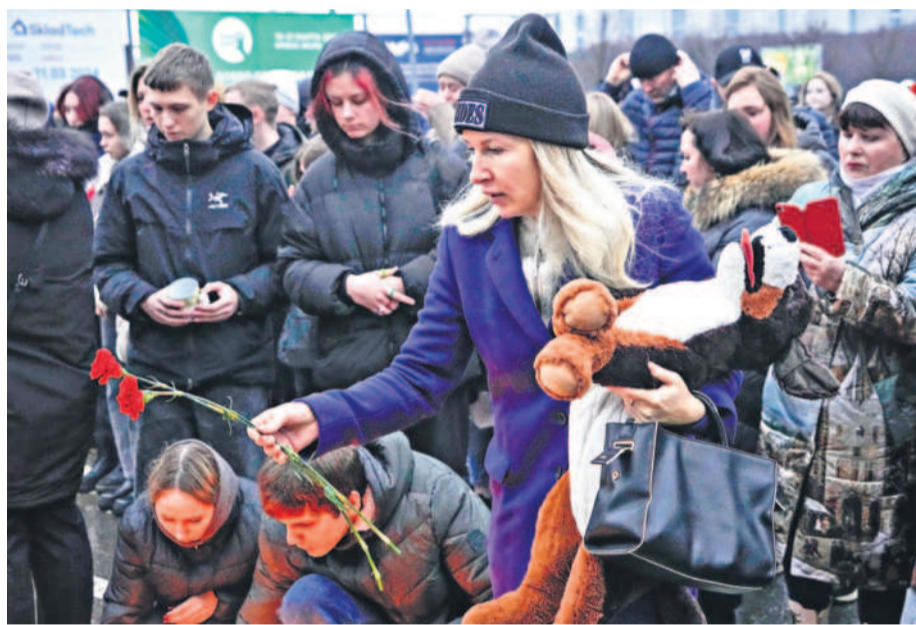
A woman places flowers next to the Crocus City Hall, near Moscow, on Saturday.

Ukraine has strongly denied any involvement and accused Moscow of using the attack to try to stoke fervor in its war effort. Putin said authorities have detained 11 people in the attack. In an address to the nation, Putin called it "a bloody, barbaric terrorist