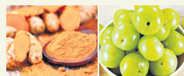
Such plant-based ingredients can not only help diabetics prevent cataracts but also other multi-factorial disorders.

A mixture of Indian gooseberry (amla), turmeric (haldi), black pepper (kaali mirch), cinnamon (daal cheeni), ginger and fenugreek (methi), which are an intrinsic part of traditional Indian medicine and a plant-based diet, have the potential to slow down cataract maturation in diabetics, recent research by scientists from the Hyderabad-based National Institute of Nutrition (NIN) said. The NIN scientists, in a timely re-