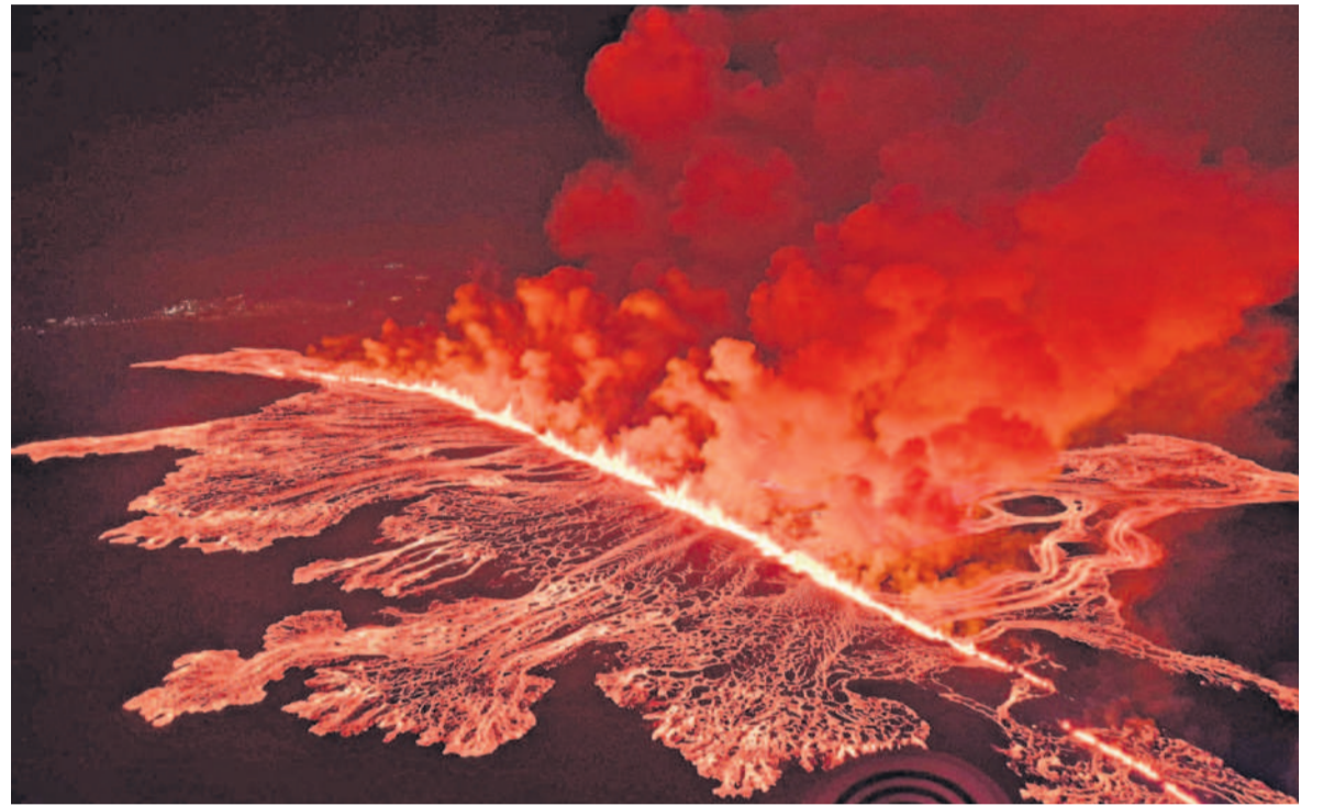
THIRD IN A ROW: Billowing smoke and flowing lava pour out of a new fissure during a surveillance flight above a new volcanic eruption on the outskirts of the evacuated town of Grindavik, western Iceland.