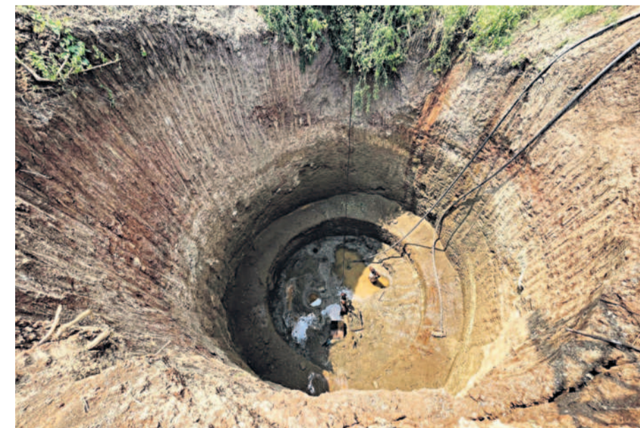
A dried up irrigation well being dug deeper to extract groundwater, in Hanamkonda.

The right canal of the Nagarjuna Sagar Project was closed on Sunday after releasing 5 TMC of its allotted quota to Andhra Pradesh. The project was left with hardly 8 TMC of water above the MDDL of 510 feet.