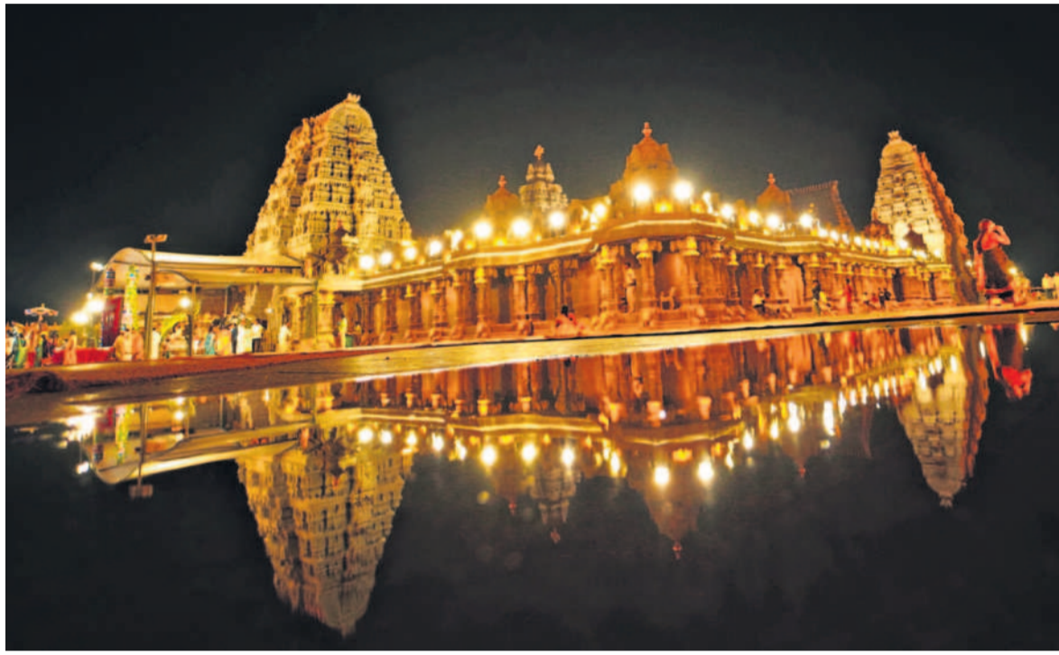
GRANDIOSE: The Lakshmi Narasimha Swamy Temple at Yadadri illuminated for the ongoing Brahmotsavams is reflected in the rainwater after a brief spell of showers lashed the region on Wednesday evening.