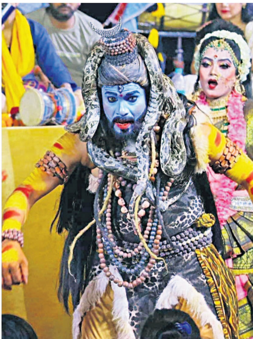
IN HIS ELEMENT: An artiste dressed as Lord Shiva takes part in a religious procession on the eve of Mahashivratri, in Ranchi on Thursday.