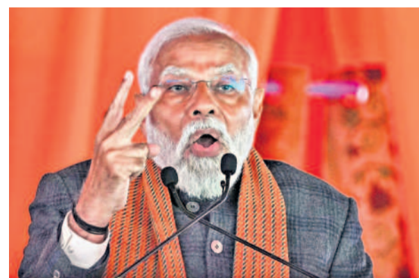
Prime Minister Narendra Modi addresses the 'Viksit Bharat, Viksit Jammu & Kashmir' programme in Srinagar.

He said the new Jammu and Kashmir has the spark for the future in its eyes and "140 crore citizens feel at peace when they see the