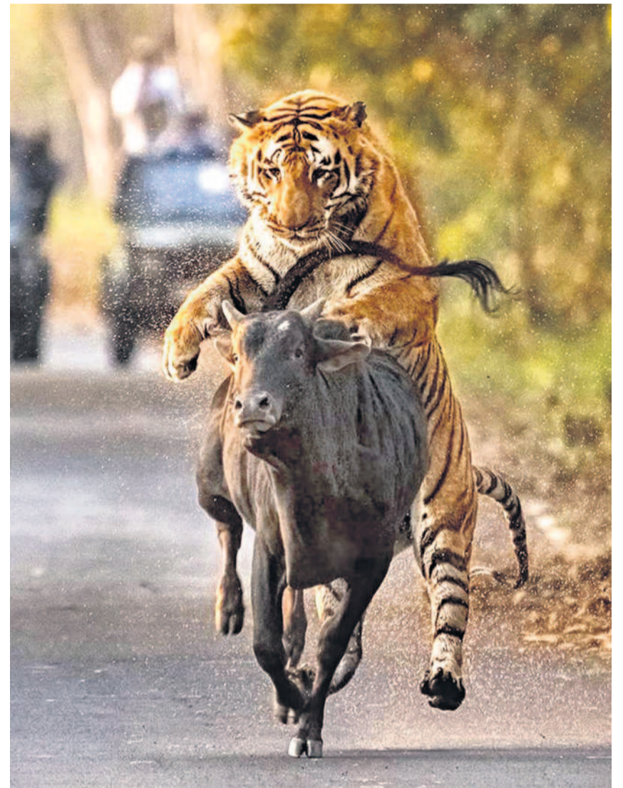
IN ACTION: Hyderabad wildlife photographer Jeetendra Chaware captures the moment of a tiger attacking a bull in Uttar Pradesh's Philibit Tiger Reserve.