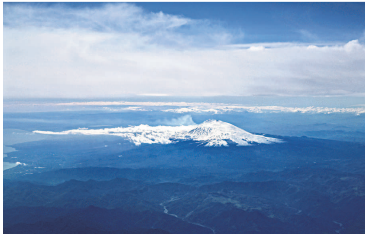
STUNNING VIEW: The Mount Etna Volcano covered with snow in Catania, Sicily.