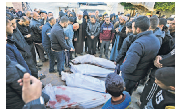
Palestinians mourn their relatives killed in the Israeli strikes, at the Al Aqsa Hospital in Deir al Balah on Thursday.

Troops fire on Palestinians waiting for aid in Gaza city