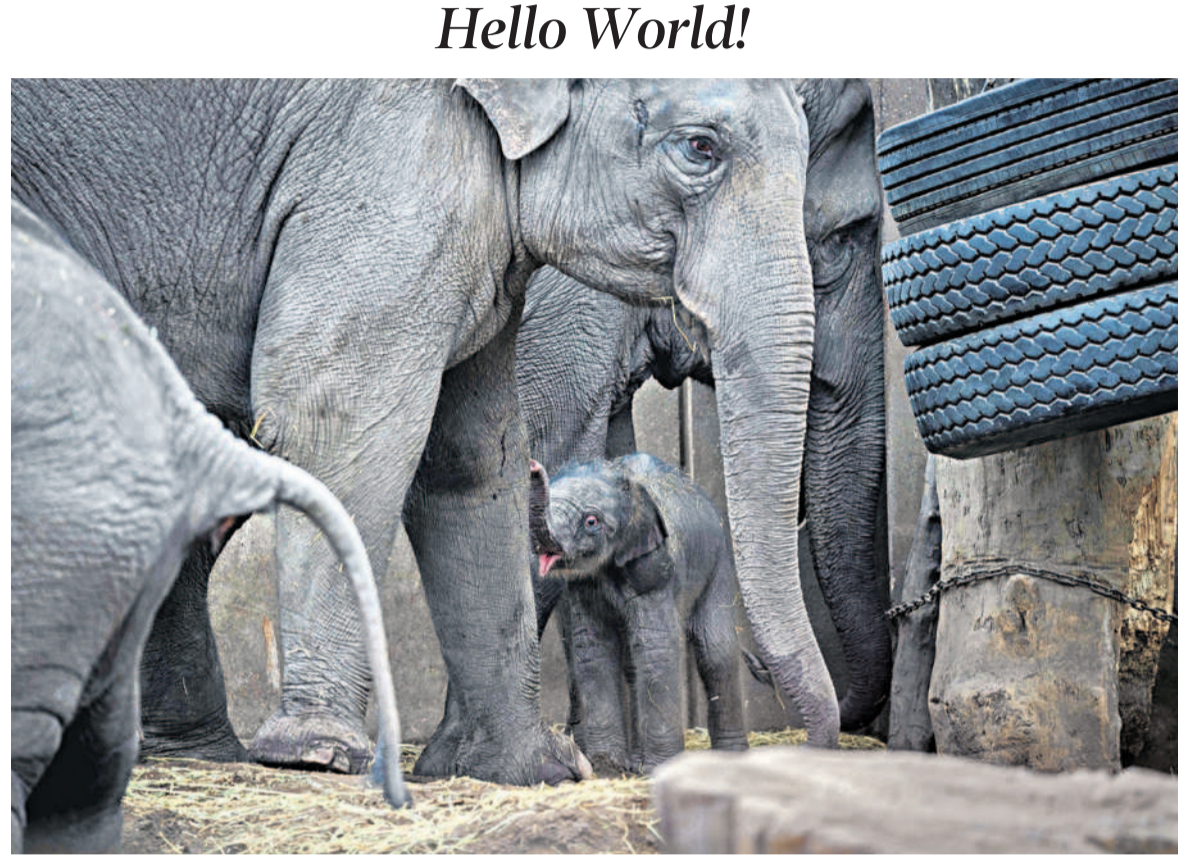
DAY OUT: A newborn female elephant calf at the zoo in Copenhagen, Denmark, on Tuesday.

drinking water under Mission Bhagiratha. The Kadem project, currently holding around 3.57 TMC of its full storage capacity of 7 TMC, faces its own challenges, as a crop holiday has been declared this year. Only around 1 TMC is available for release as the project's dead storage level is 2.5 TMC. Further, the State government recently directed the officials to release water downstream from the Sundilla barrage after alleged leakages were reported at the barrage. (SEE PAGES 2, 3)