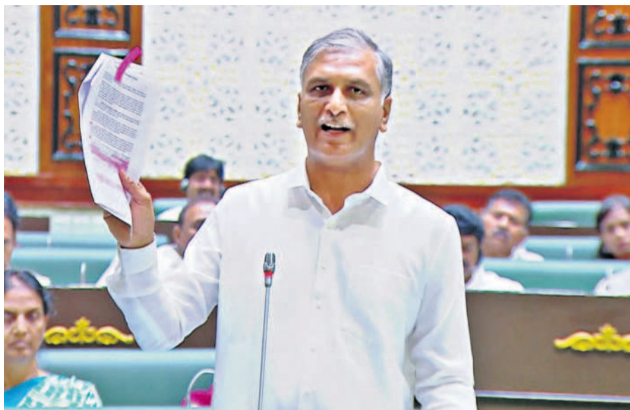
Former Irrigation Minister and BRS MLA T Harish Rao speaks in the Assembly on Monday.

The main opposition party, the BRS, fielded former Irrigation Minister and Siddipet legislator T Harish Rao to put the government in a spot over its negligence in agreeing to hand over the