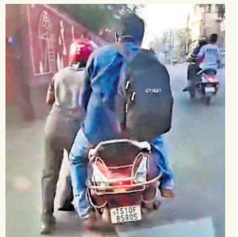
A screen grab of the video where the bike taxi rider is pushing the vehicle to a petrol pump.

The passenger reportedly had hoped on the bike taxi after booking a ride and when the bike ran out of petrol en route, the rider requested the passenger to walk to the nearest petrol station. However, the passenger allegedly refused to comply with the rider's request, prompting the latter to push the two-wheeler manually, while the customer continued to sit on the bike.