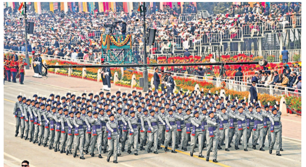
National Service Scheme volunteers march during the Republic Day parade at Kartavya Path in New Delhi. (REPORTS PAGE 7)

In a first, parade heralded by over 100 women artistes