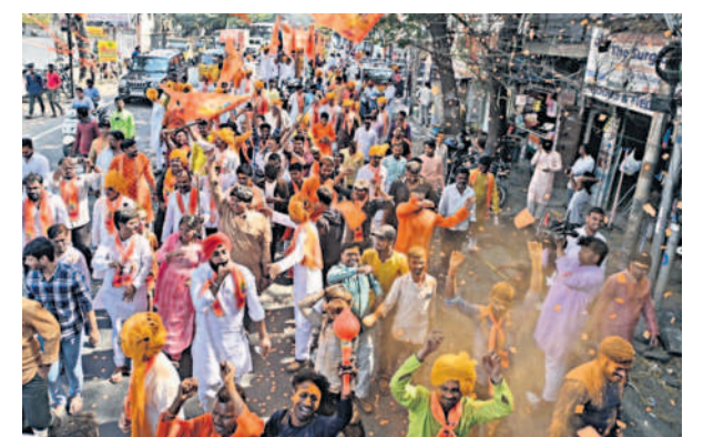
A celebration rally at Nampally in Hyderabad on Monday.

From special rituals at temples, including at the Sri Seetha Ramachandra Swamy Devasthanam in Bhadrachalam, known as Dakshin Ayodhya, to Shoba Yatras with devotees carrying saffron flags, chanting mantras and raising 'Jai Shri Ram' slogans, the State wore a festive look with saffron dominating the colours of the day. From devotees