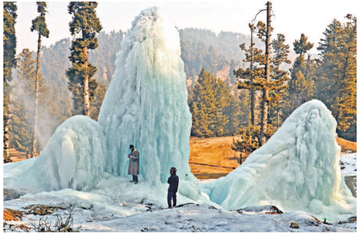
WINTER WONDERLAND: People stand near the tall icicles formed after leaks in water pipelines at Tangmarg in north Kashmir on Friday.