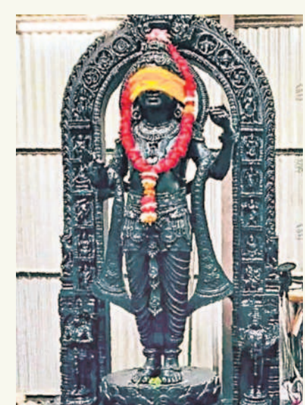
The Ram Lalla idol at the Shri Ram Janmabhoomi Mandir.