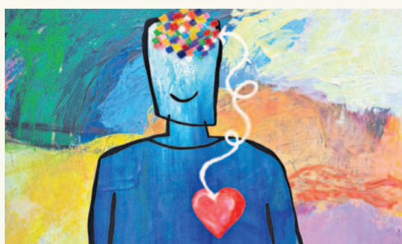
When we are in love, our brain reacts differently. It makes the object of our affections the centre of our lives, say scientists.

In a world-first study, a team of Australian scientists investigated the link between the human brain's behavioural activation system (BAS) and romantic love and decoded why "love is blind." It is well known that romantic love changes the brain, releasing the so-called love hormone oxytocin, responsible for the euphoria we feel when falling in love. Now, researchers from the Australian National University (ANU), University of Canberra and University of South Australia have measured how a part of the brain is responsible for putting our