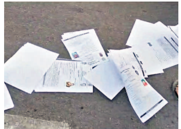
The application forms which were found on the Balanagar flyover in Hyderabad while being transported.

Several Praja Palana applications, on which the dreams and aspirations of several hundreds of people depended, were found scattered and flying in the wind on the streets of the city on Monday and Tuesday, posing a serious question on the measures by the State government to ensure security of public data and benefits from the Praja Palana programme to the public.