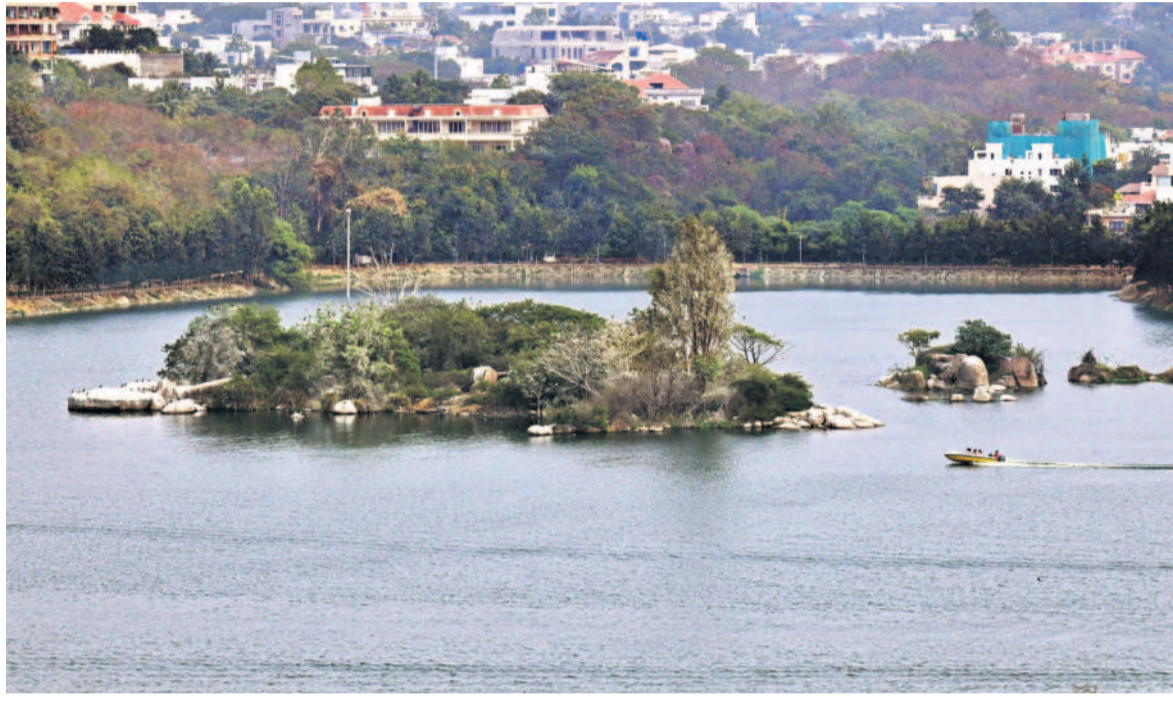
JOY RIDE: People go on a boat ride in Durgam Cheruvu on Tuesday. The day and night temperatures in the city saw a slight rise with minimum temperatures rising above the seasonal average. (REPORT PAGE 3)