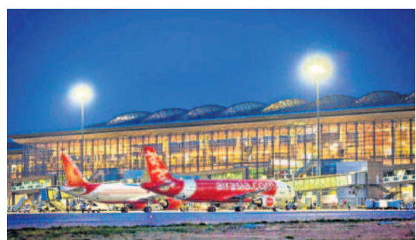
With an On-Time Performance of 84.42%, RGIA is at the second spot in the global airports as well as large airports categories.