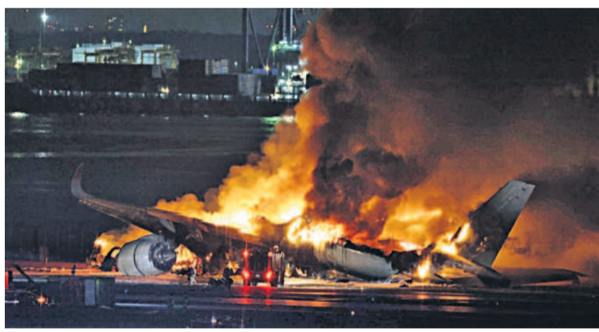
NARROW ESCAPE: A Japan Airlines plane on fire on the runway of Haneda Airport. The plane collided with a Japanese coast guard aircraft and burst into flames. While five people on the smaller plane were killed, 379 flyers on JAL-516 got out safely.