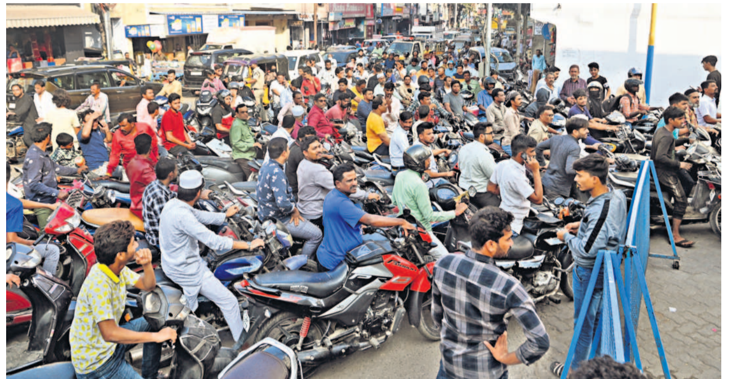
Heavy rush at a fuel station following nationwide strike of truck drivers, in Hyderabad on Tuesday.

Long queues lead to traffic jams as truckers go on nationwide strike