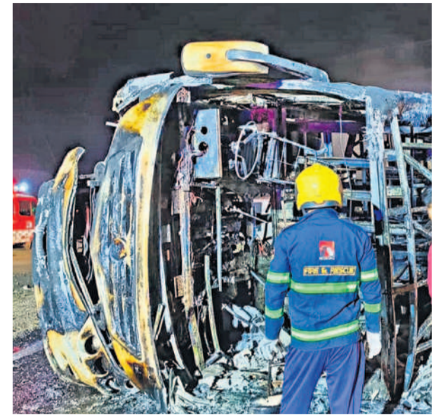
Rescue operations under way on the Samruddhi Expressway in Buldhana district, Maharashtra, on Saturday.

According to police, eight persons, including the driver and cleaner (driver's assistant), survived. A case of negligent driving was registered against the driver, with police believing, prima facie, that he dozed off at the wheel and lost control of the vehicle.