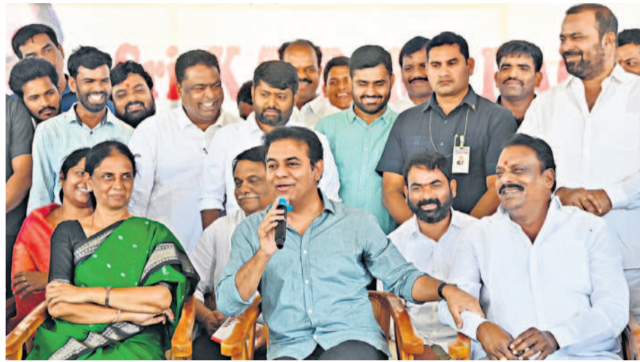
MA&UD Minister KT Rama Rao during the inauguration of the ORR Narsingi interchange in Hyderabad on Saturday.

Speaking after inaugurating the interchange at Narsingi on the Outer Ring Road (ORR) here on Saturday, Rama Rao said the State government had sought half an acre of defence land for constructing a skywalk at Mehdiapatnam. This was being constructed on the lines of the one launched at Uppal last week, he said. The skywalk at Mehdiapatnam was pro-