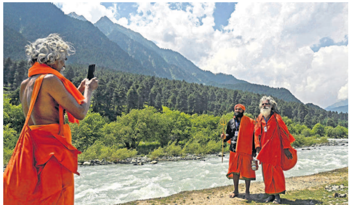
CAPTURING MOMENTS: A sadhu takes pictures on a mobile phone at the Nunwan Pahalgam base camp before proceeding towards the holy cave shrine of Amarnath on Saturday.